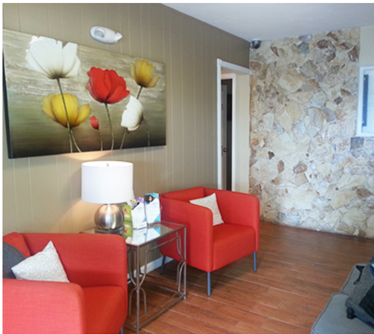
Front Entrance - Waiting Room