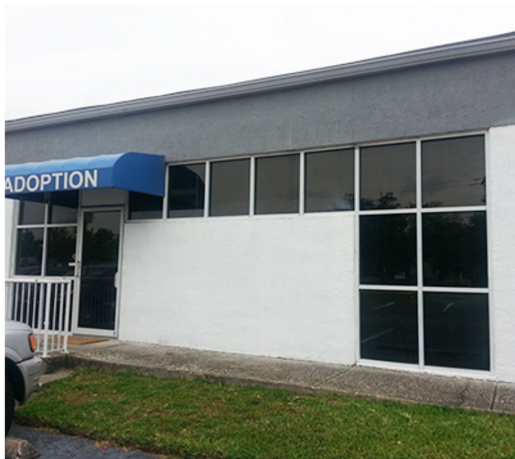
Front of Building - Entrance