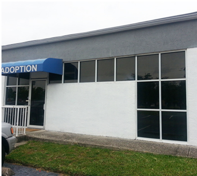
Front of Building - Entrance