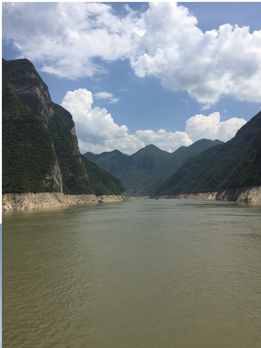
Photo taken during Yangtze cruise