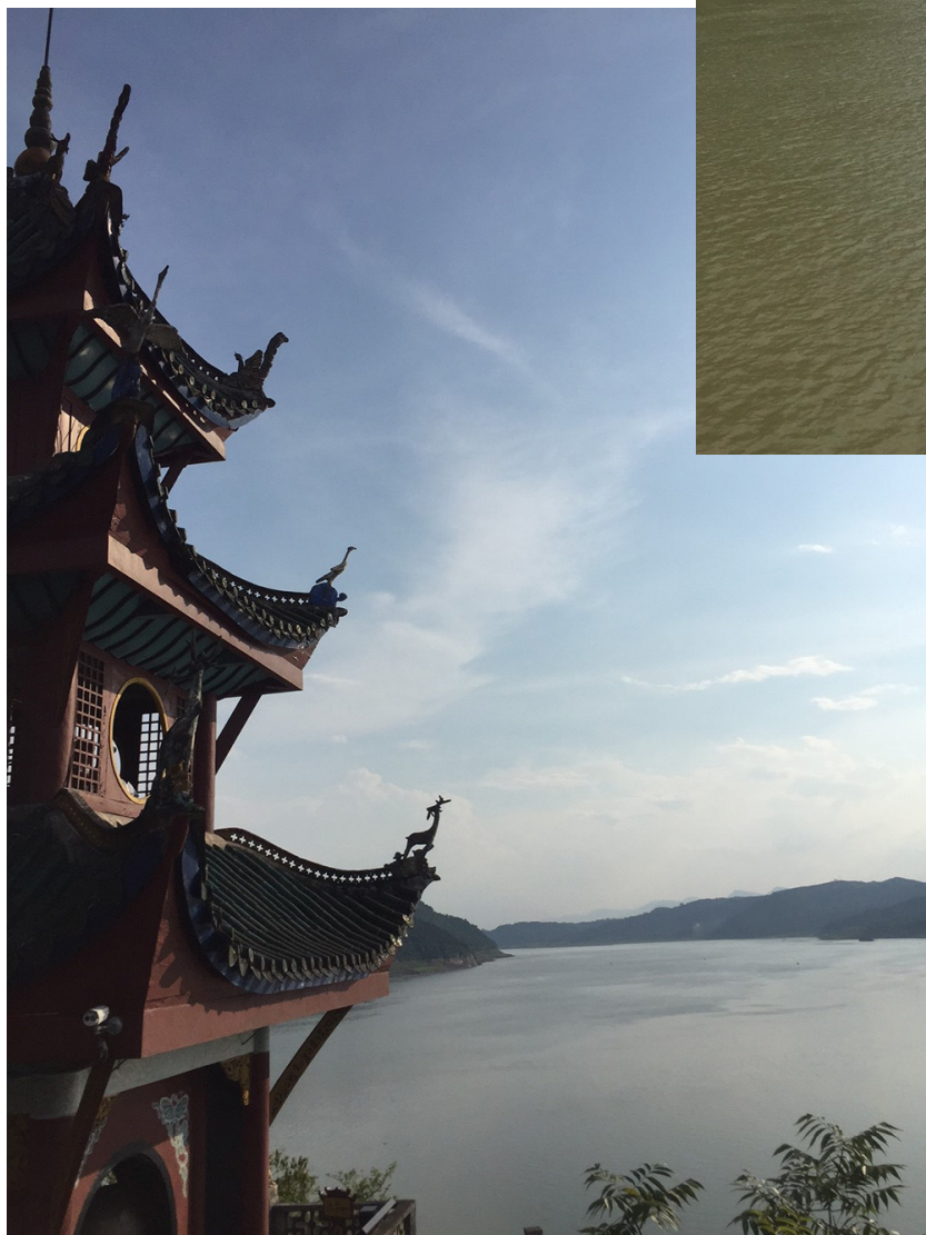
Photo taken at the ShiBaoZhai Pagoda while on the Yangtze cruise excursion